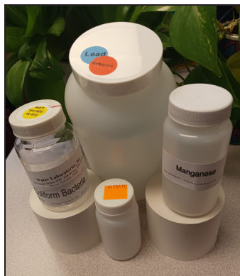
Kits test for bacteria, nitrates, arsenic, lead and manganese.

Ensuring groundwater is safe to drink — by decreasing the risk of nitrate contamination,