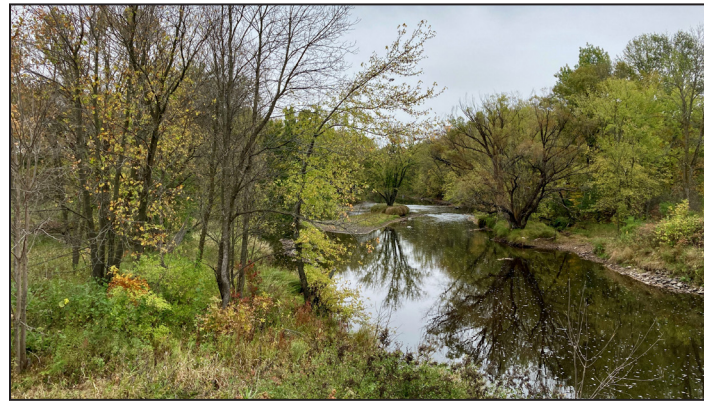
The Rum River flowed through Mille Lacs County. Water levels were low because of a drought.

State grants included two rounds of WBIF from BWSR: $1.28 million in 2023 and $1.33 million in 2025.